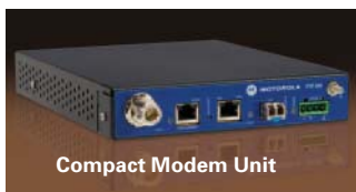
Compact Modem Unit